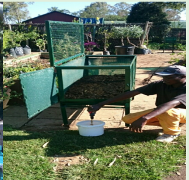
Medium Worm Farm without pump