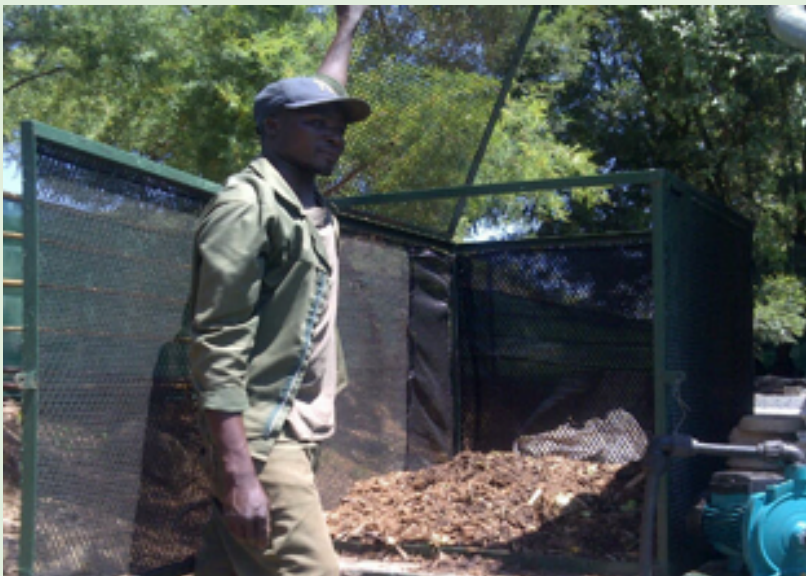
Medium Worm Farm with pond and pump